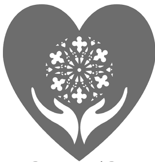
Congregational Care Ministry