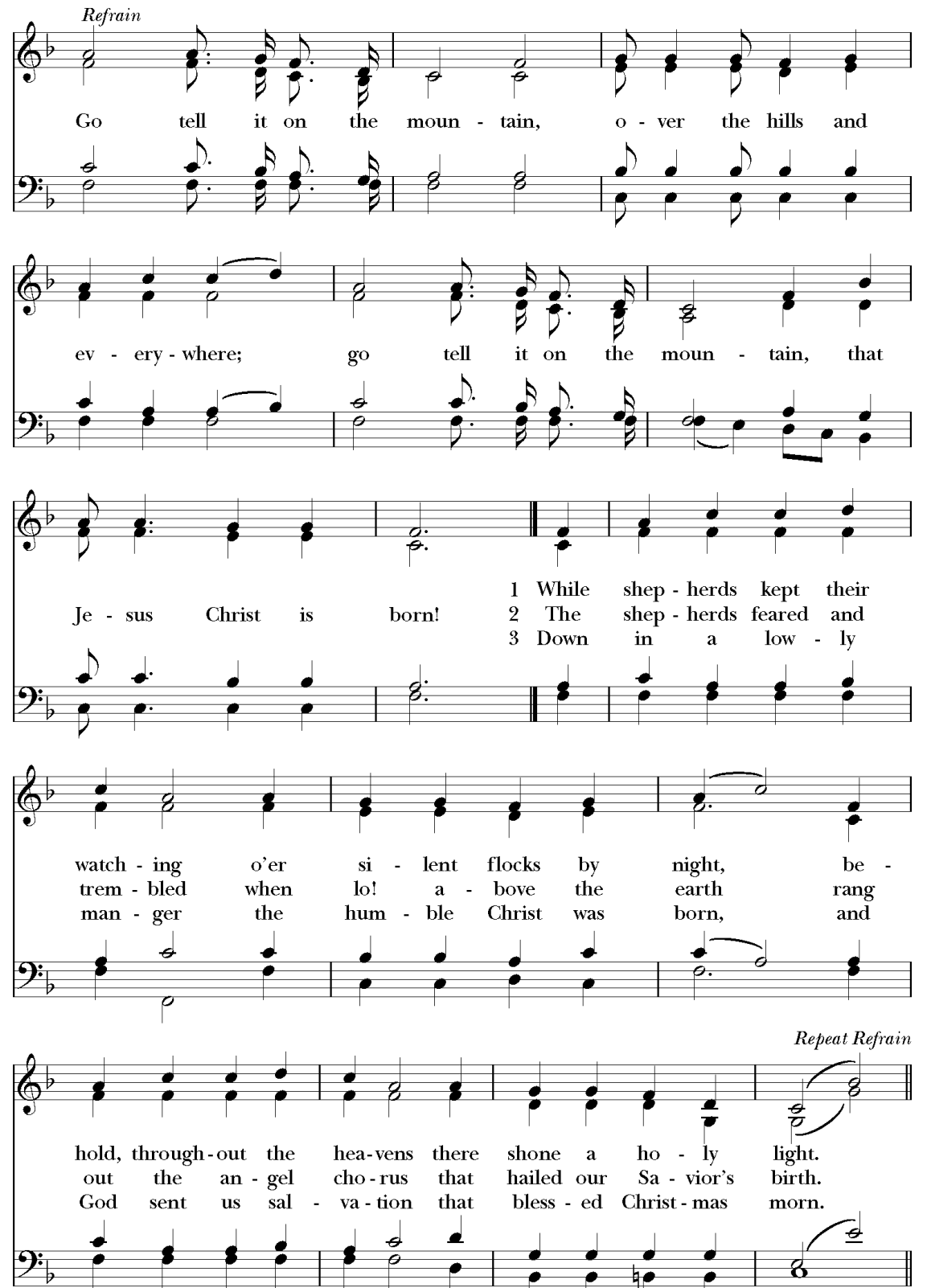
*Opening Hymn "Go tell it on the mountain"